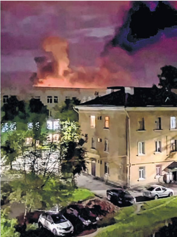
An explosion lights up the sky as the Russian military repel a drone attack on an airport in the northwestern city of Pskov

Volodymyr Zelensky said that a Ukrainian-made weapon had hit a target at a distance of 700km. Pskov is nearly 700km (434 miles) from the Ukrainian border.