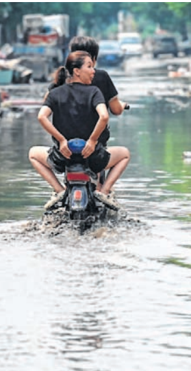
Record Downpour: Residents ride a scooter on a flooded street in the aftermath of heavy rains in Zhuozhou city, in China on Wednesday

PESHAWAR: Gunmen attacked police officers providing security for polio vaccination workers during a door-to-door campaign in northwest Pakistan on Wednesday, killing one of them before fleeing the scene, police said. The attack occurred in Bannu district in Khyber Pakhtunkhwa province on the third day of a weeklong anti-polio drive to vaccinate 2.7 million children in the province, according to Nasit Shah, a local police official. No one has claimed responsibility, but Pakistan's anti-polio campaigns are regularly marked by violence. Pakistani militants often target polio teams and police assigned to protect them, falsely claiming that vaccination campaigns are a Western conspiracy to sterilise children.